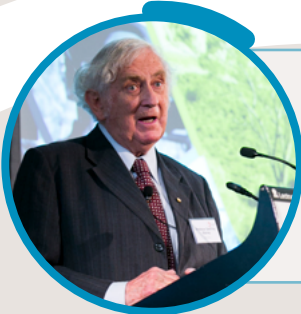
28 April 2016 CME 115th Annual General Meeting and Business Lunch