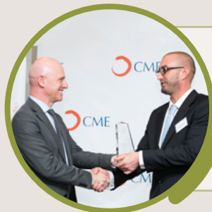
3 August 2016 CME Safety and Health Innovation Awards