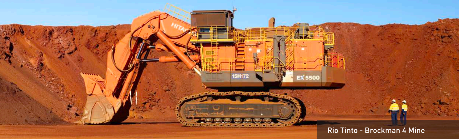
Rio Tinto - Brockman 4 Mine