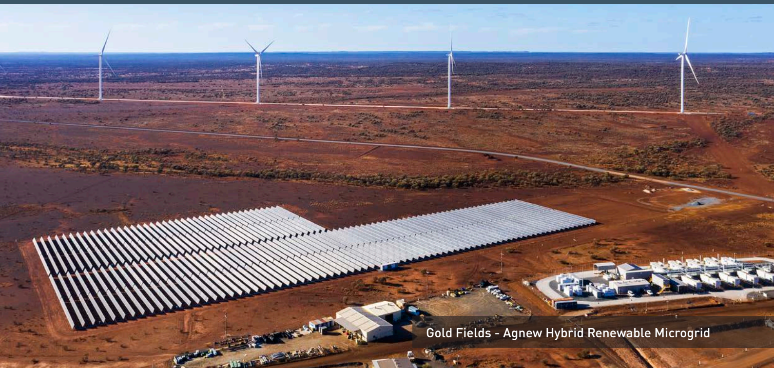
Gold Fields - Agnew Hybrid Renewable Microgrid

On a personal note, this annual report and the accompanying AGM concludes my chapter as CME President after two fulfilling years in the role. It has been a privilege to work with such a great team and I wish my successor as CME President all the best for the future.