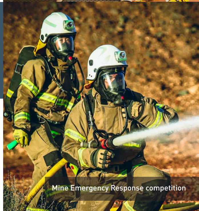
Mine Emergency Response competition